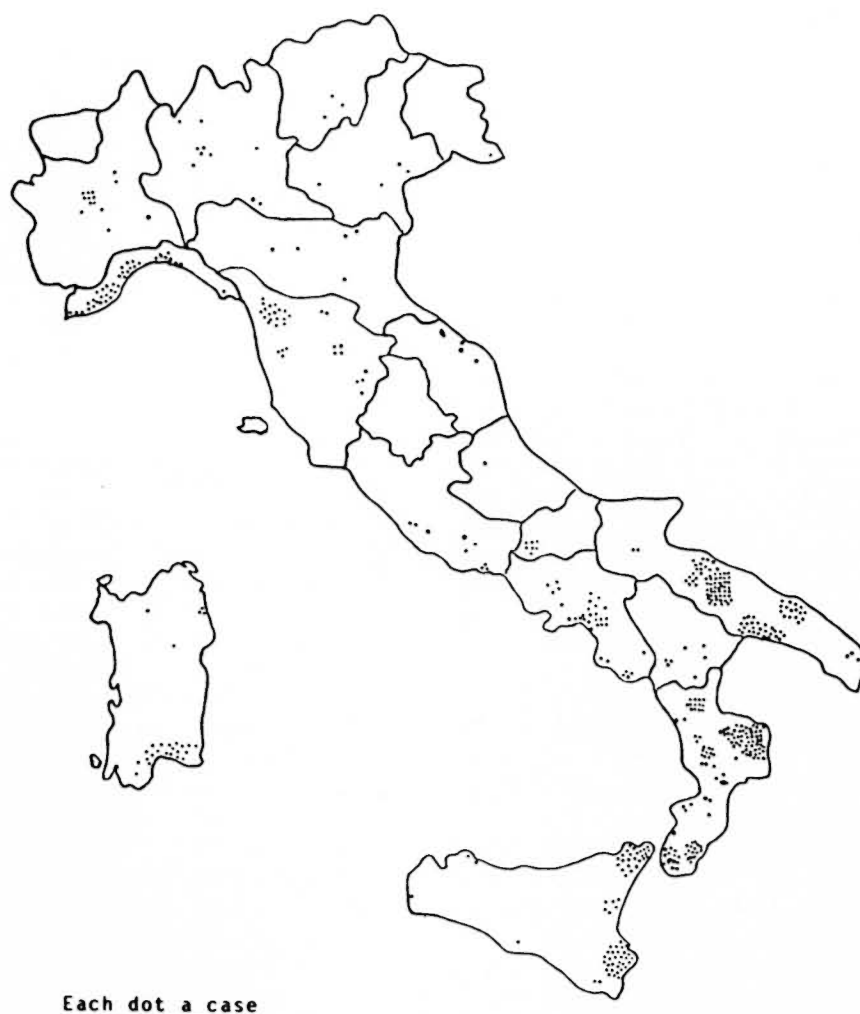
FIG. 1. Geographical distribution of leprosy in Italy, 1980.

indigenous cases compared to 6.1 for imported ones, reflecting higher immigration rates in males.