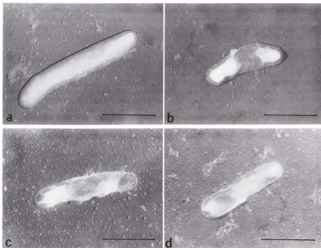
FIG. 1. M. lepraemurium , 30 years after lyophilization, suspended in saline (a, b) and in 10% bovine serum-water (c, d). Chrome shadowed. Bar represents 1 \mu m.

mogenate produced a typical leproma in secondarily inoculated C3H mice.