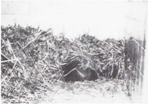
FIG. 1. Armadillos in a ceramic-lined cage. During the day, armadillos spend most of the time hidden within the bedding, but they show themselves when, hungry, they come out for food.