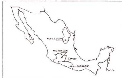
FIG. 2. Map of Mexican Republic showing areas where armadillos ( D. novemcinctus ) are usually captured, the states of Nuevo Leon, Michoacan, and Guerrero. Our experimental armadillo colony is located in Mexico City (D.F.).

cutaneously at the injection site on the femoral region. From the 30 armadillos so far inoculated with M. leprae , 10 animals have developed a systemic disease of variable degree ( 7 ). On the average, the earliest external signs of disease appear 11 months after inoculation, and include enlargement of the inguinal and cervical lymph nodes, and the appearance of small nodules in the inner aspect of the shell border and sometimes between the shell bands (Fig. 3). At this time, bacilli are easily found in smears from ear lymph. Autopsy of the sacrificed infected animals shows all of the morphological and histopathological changes already described by other groups ( 6 ). The collected infected material is preserved without trimming at -70^{\circ}\text{C} until used. The remains are immediately incinerated.