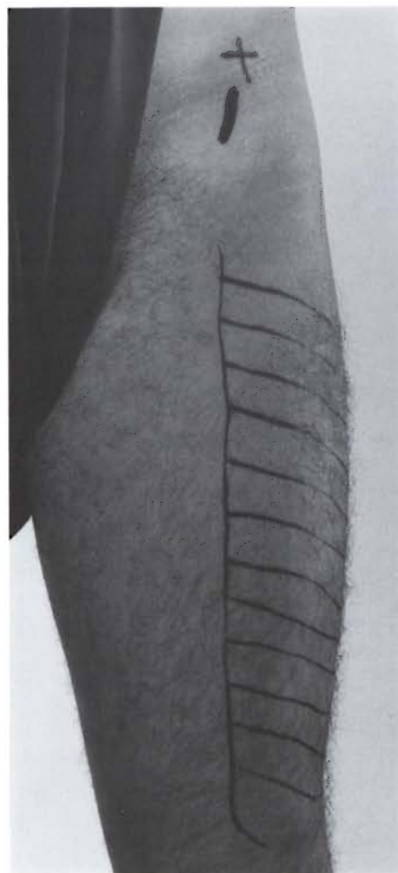
FIG. 1. Case 1. Enlarged lateral femoral cutaneous nerve (LFCN) and loss of sensation at the anterolateral side of left thigh; + = anterosuperior iliac spine.

A cytological needle aspiration of the affected nerves showed multiple AFB in both nerves. The diagnosis of meralgia paresthetica due to leprosy neuritis was supported by bilateral diagnostic blocks each with 15 ml lidocaine 0.5% to which was added 8 mg dexamethasone acetate. Subsequent to ad-