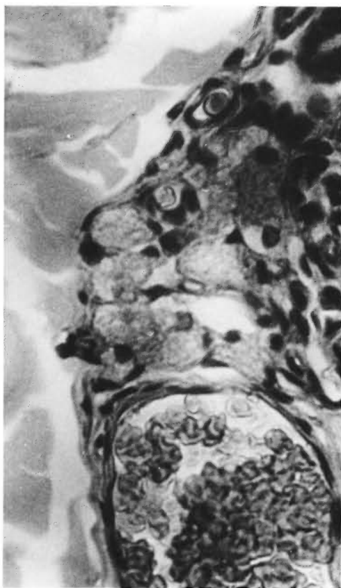
FIG. 3. A small collection of macrophages and lymphocytes near a blood vessel. Patient had leprosy for 20 years and treatment for 5 years; biopsy was performed 2 years after cure (H&E \times 1120 ).

were declared cured with multidrug (MDT). In 22 of them, small lepromatous granulomas were seen to persist, although acid-fast bacilli were not found in them. The presence of these granulomas was not found to have any significant association with the duration of the disease, length of treatment, or the period of cessation of therapy.